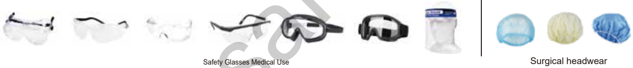
Safety Glasses Medical Use